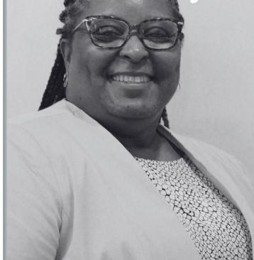
Healthcare Army Veteran