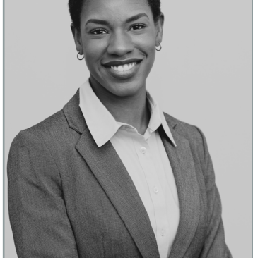
Energy & Utilities