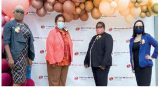
"My life has been enriched with lasting knowledge."