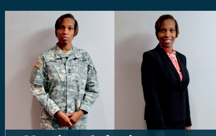
More than 360 female veterans were impacted in 2018 through specialized veteran service programs.

For four years, Houston Symphony's Community Embedded Musician program has presented content on communication skills, adaptability and focus to the