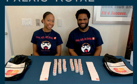
Twelve companies met with over 40 female veterans at our Career Fair in November.