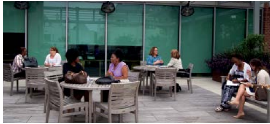
ABOVE: Mentor and mentee pairs meeting for their first conversation at the Spring W2W kick-off event. This nine-month commitment often results in life-long friendships.

"PWG has helped me to change the way I think, to be a more professional woman. And the scholarship has been a dream come true!"