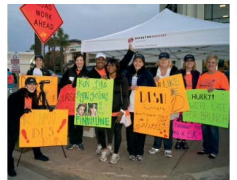
ABOVE: Volunteers and staff cheering for Team DFSHouston on race day.