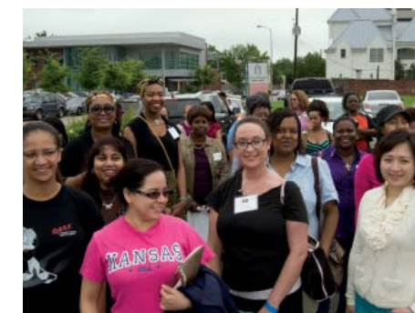
ABOVE: PWG members taking a tour of the Saturday morning Urban Harvest Farmer's Market as part of a Health and Wellness class.